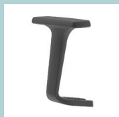
Fixed black plastic armrests