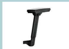
3D (three directions) adjustable armrests