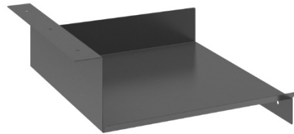
Metal shelf (right)