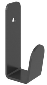
Metal hook for clothes