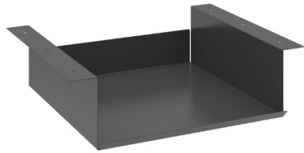
Metal shelf (central) for doors with mail slot

Customize your locker by using additional items.