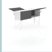
Cabinet placed on 2-desk bench