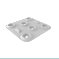
Fittings for desktop connection (2 pcs.)