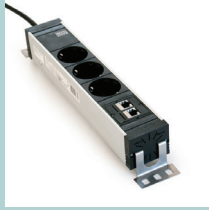
Power socket blocks