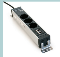
Power socket blocks