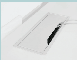
Metal grommet: 317x119, H=27 mm