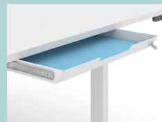
Felt-lined metal drawer with lock