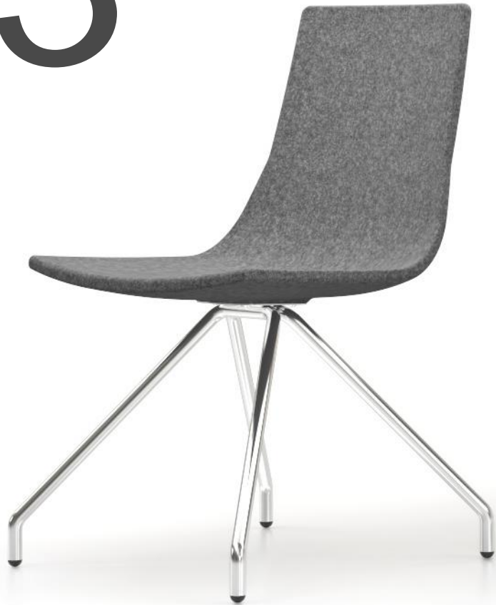
Cosy and delicate 4-leg base