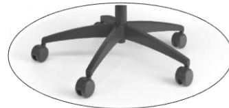
Black plastic 5-star base