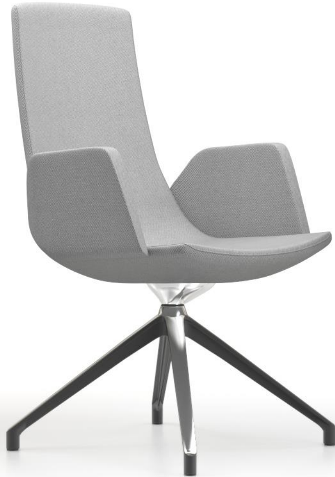
Elegant and sophisticated swivel, 4-leg base in polished aluminium