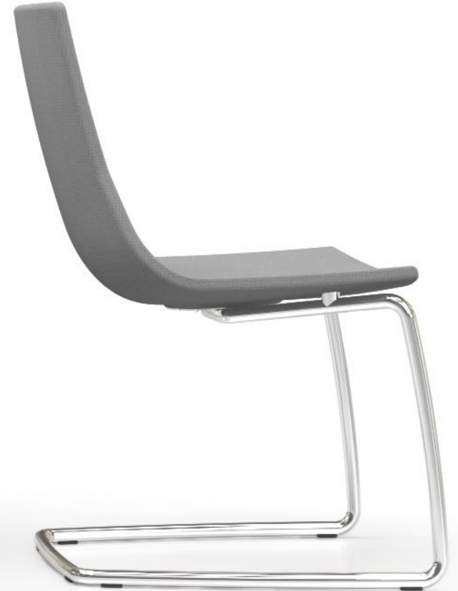
Comfortable cantilever base