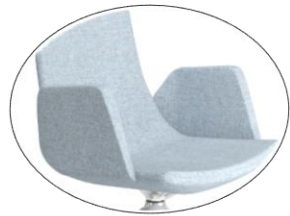
Upholstered polyurethane armrests