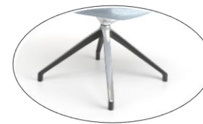
4-star swivel base