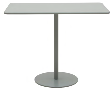
Table dimensions L 100 D 60 H 70 cm

With the addition of a table for the OPERA series, even more functions and possibilities have been added to the flexible and versatile family. The table's design matches the softly rounded corners of the upholstered furniture, and the dimensions of the table top harmonise with the back and sides of the seating furniture. Combined with the OPERA partition wall, intimate and informal meeting rooms can be created. The new table is an important supplement to any group arrangement of the OPERA series' seating furniture with both high and low backrest.