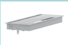
Metal grommet: 317x119 mm, H=27 mm