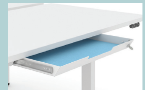
Felt-lined metal drawers with lock