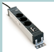
Power socket blocks